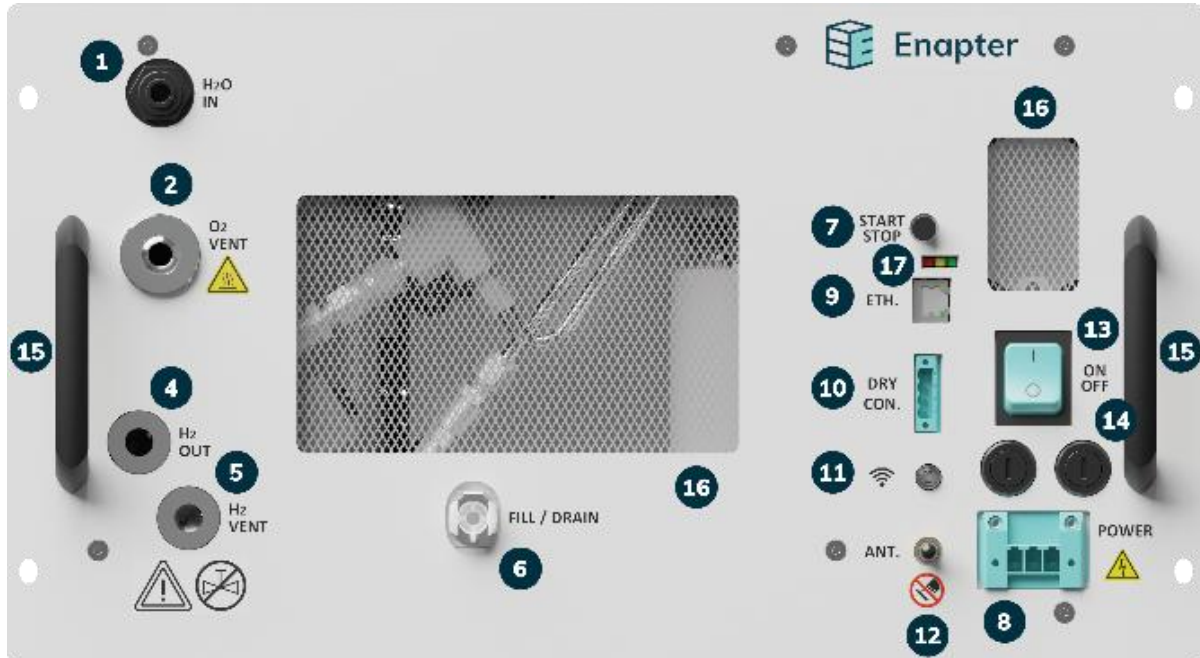
EL4.1 air cooled AC version front view

The following figure shows the position of the EL4.1's physical interfaces.